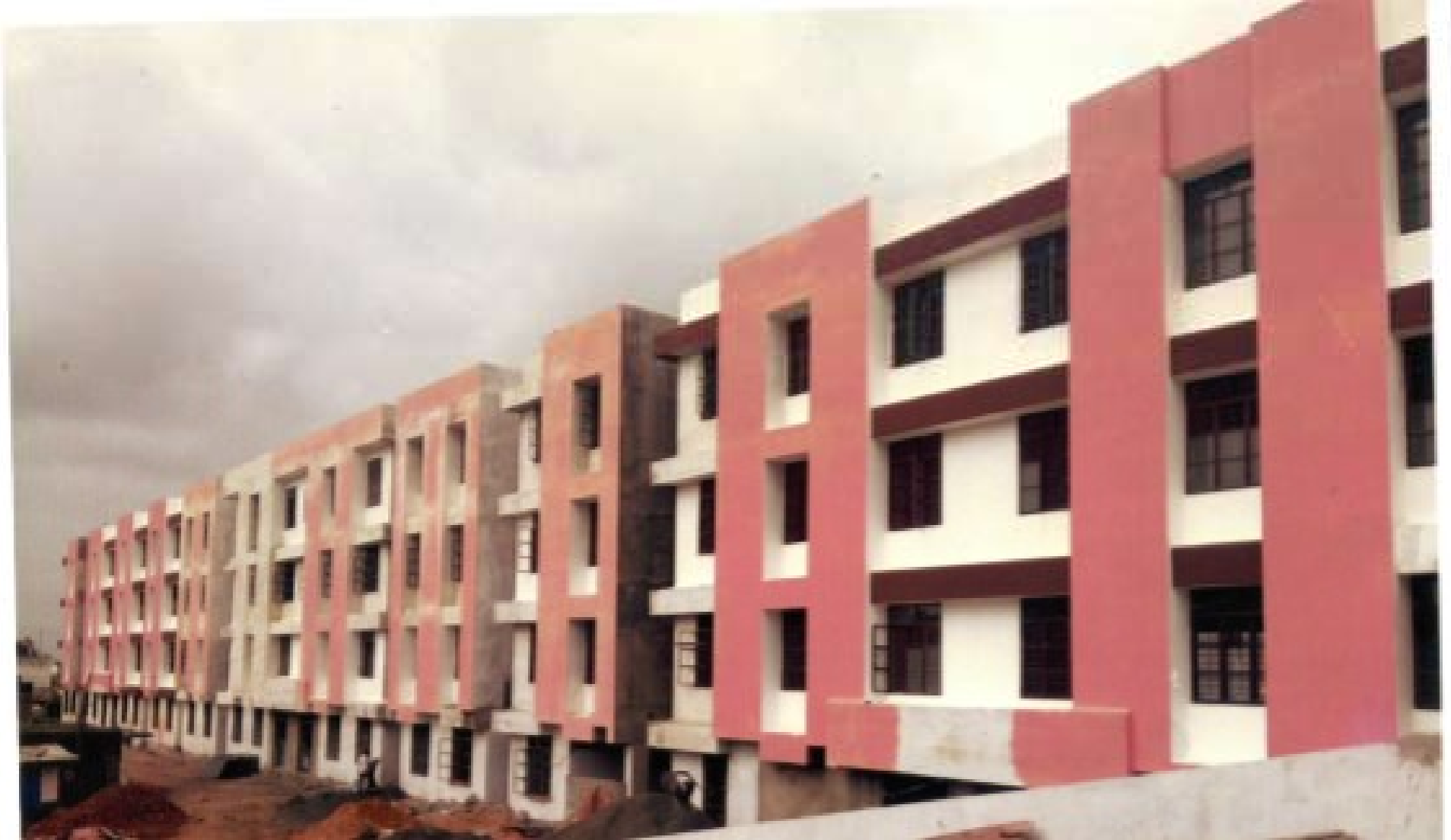
500 SEATER OBC GIRLS HOSTEL AT ASRAVAD, INDORE